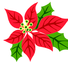
Start your holiday shopping early

may accommodate your needs at the convenience of your routine appointment. No waiting to order, No searching through books, just seek and you shall find here at New Boundaries. Get