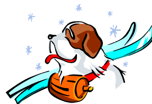
Have fun this winter but remember to replace moisture

content is low you will find areas of breakage or experience extreme to moderate shedding depending on your situation. So please be sure to replace